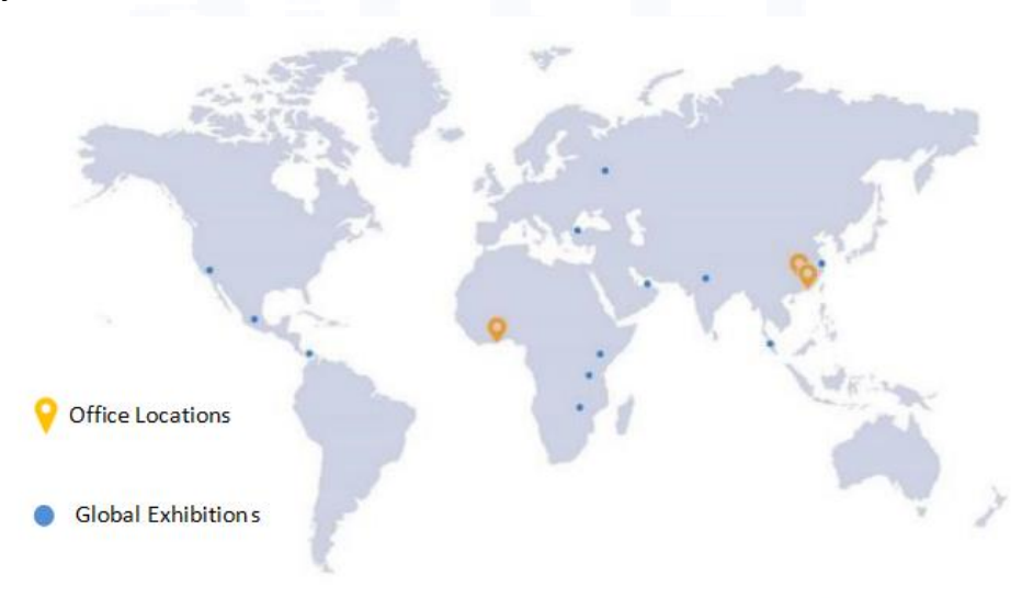
Pic No. 5